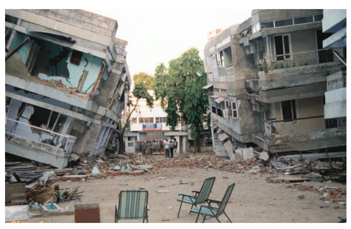
Soft story collapse during the Bhuj, India Earthquake

The experience of the CRE team at AIR includes extensive work in the probabilistic quantification of natural and man-made hazards, and engineering investigations and analyses of a broad range of physical assets including development of appropriate physical repair and design concepts. Their experience ranges from risk and damage