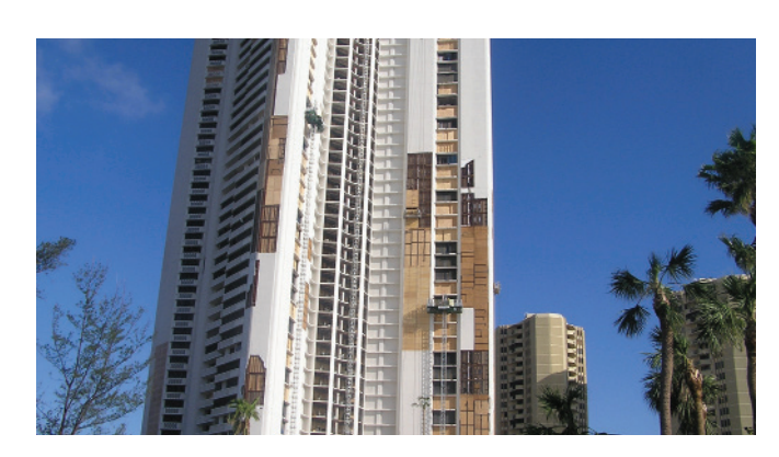
Damage to building envelope from high winds during Hurricane Jeanne