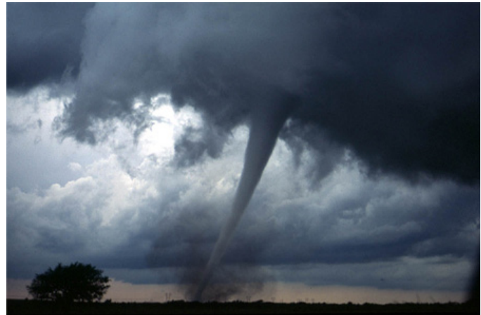
Figure 2. The classic funnel-shaped cloud of a tornado

Tornadic supercell thunderstorms require one additional and important condition: sufficient wind shear (wind speed and direction that change with height). Wind shear is the chief factor influencing a storm’s movement and, in the case of a tornadic thunderstorm, the storm’s ability to develop a rotating updraft. The first three conditions—instability, moisture, and lifting mechanisms—can affect the storm’s precipitation rate and/or hail generation and size; the development of a rotating updraft marks the storm’s transition to a supercell capable of producing a strong combination of all three perils: downbursts and straight-line winds, large hail—and tornadoes.