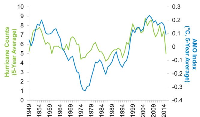
Figure 1. AMO correlation to Atlantic hurricane activity, 1949–2015.

phase of the Atlantic Multidecadal Oscillation (AMO), a naturally occurring climate signal with an irregular periodicity that spans decades. Other experts believe that SSTs are elevated primarily because of the accumulation of greenhouse gases in the atmosphere and that variability in SSTs is caused by episodic events, such as volcanic activity, sunspots, and the industrial release (and subsequent decay) of aerosol sulfates.