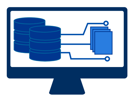
Visualize your exposure data and leverage Verisk's industry exposure databases to generate loss estimates.

Insurers can also leverage the IED to benchmark their portfolio risk relative to the industry, as well as gain insight into the accuracy of losses modeled in Touchstone—a meaningful starting point to assessing data quality.