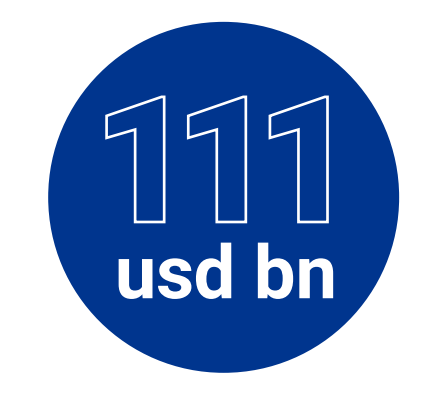
Cost of catastrophic events to the property insurance industry in 2021

Touchstone Re<sup>™</sup> allows you to quantify and manage the loss potential of reinsurance contracts and portfolios, enabling you to manage your pricing and portfolio management workflows as never before.