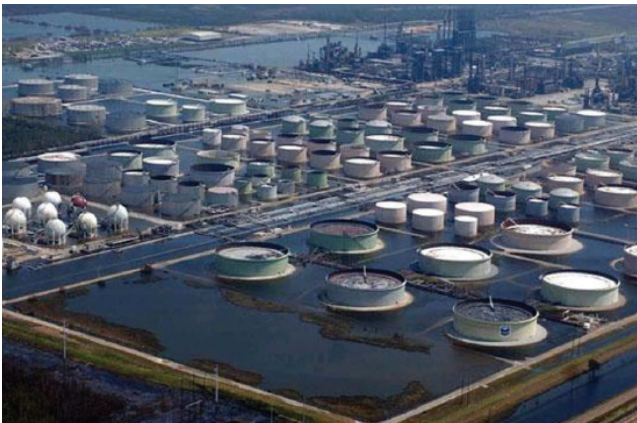
Damage to a refinery during Hurricane Katrina

AIR's CRE Consultants include scientists and engineers who are experts in a broad range of technical specialties, including earthquake and wind engineering, structural evaluations and dynamics, geotechnical engineering, meteorology, seismology, risk and decision analysis, and probability and reliability theory. It is this mix of expertise that allows the AIR CRE team to holistically address all aspects of the performance and reliability of structures in an uncertain dynamic loading environment, whether natural or man-made.