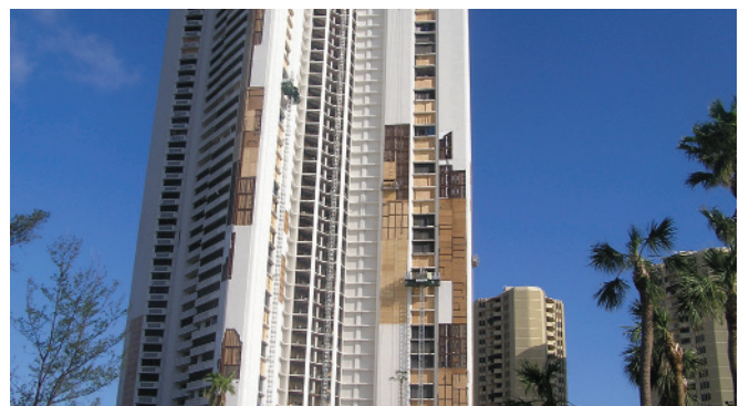
Damage to building envelope from high winds during Hurricane Jeanne