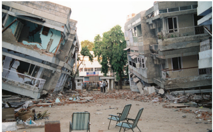
Soft story collapse during the Bhuj, India Earthquake

The experience of the CRE team at AIR includes extensive work in the probabilistic quantification of natural and man-made hazards, and engineering investigations and analyses of a broad range of physical assets including development of appropriate physical repair and design concepts. Their experience ranges from risk and damage