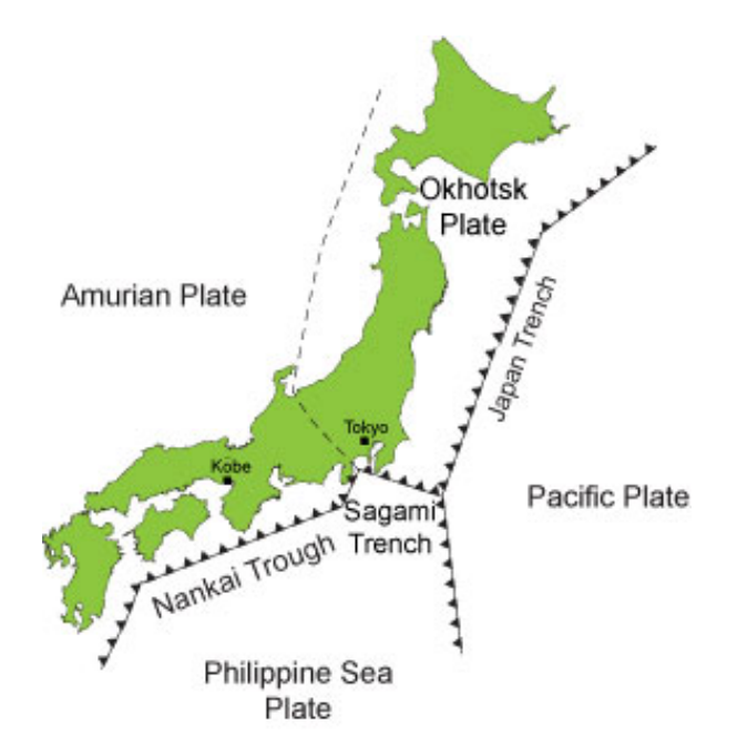
Figure 1: Japan's Tectonic Plates (the arrows show relative motion of the oceanic plates with respect to the continental plates).

The last truly devastating earthquake occurred on the morning of January 17th, 1995, approximately 20 miles from the city of Kobe. The Hyogo-ken-Nanbu, or Kobe, earthquake killed more than 6,000 people and caused more than USD 100 billion in damage. It registered a magnitude 7.3 on the JMA scale (equivalent to moment magnitude 6.9) and is generally regarded as the costliest natural catastrophe to befall a single country.