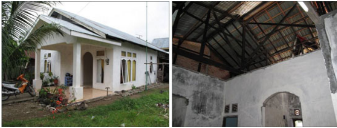
Figure 3: Residential house in Padang (left) and typical roof configuration (right).