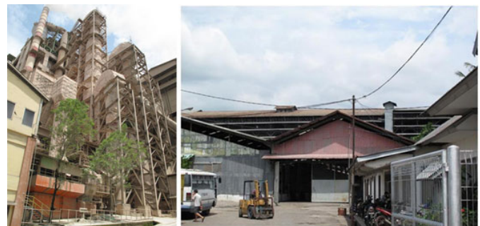
Figure 5: Cement plant (left) and rubber plant (right) in Padang. Only minor damage was observed, though business interruption was likely an issue for these insured facilities.

Industrial buildings performed very well during the earthquake, with most industrial facilities showing little or no structural damage. However business interruption played an important role since for all practical purposes all production in Padang stopped for a week due to electrical power cuts (service in Padang was cut as a precaution against fires igniting due to short circuits). Even after power was restored, machinery had to be recalibrated before start-up; nearly 40 days after the event, most industrial production had not yet reached 100% of pre-earthquake levels.