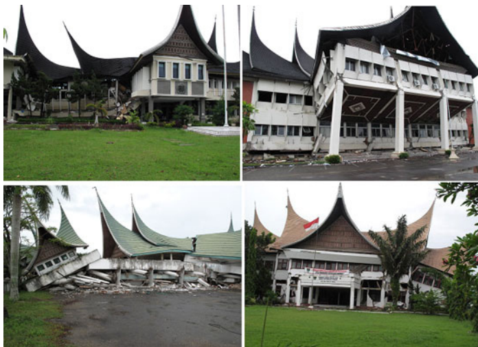
Figure 6: Collapse of governmental buildings in Padang, caused by soft storey effects.

Two private hospitals (both uninsured) sustained heavy damage to non-structural elements and moderate to high levels of damage to columns. Even though the largest public hospital in Padang coped very well with the emergency, the building housing the outpatient clinic collapsed as a result of soft storey failure. This structural behaviour was surprising given that is something that design codes clearly aim to avoid due to the importance of hospitals after an event like this one. A point worth noting is that governmental buildings are the only structures for which, by law, supervision of the implementation of the codes during construction is implemented.