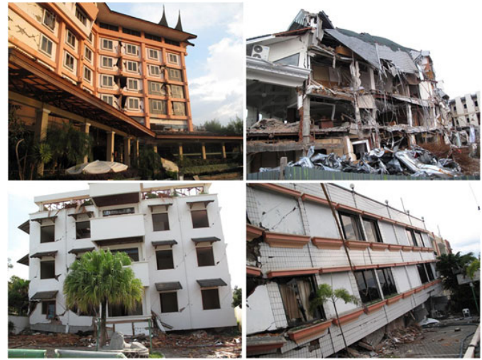
Figure 4: Examples of severe damage and collapse of Hotels in Padang. With the exception of the Bumiminang Hotel (top left) that suffered severe damage to infill walls, though the structural elements behaved generally well, most failures in hotel structures occurred due to soft storey failure, as shown in the other panels.

The results of a number of interviews carried out during the survey confirmed that hotels and large commercial structures (i.e., shopping centres) were in fact insured against the earthquake peril—a circumstance that undoubtedly led to the relatively large reported insured losses from this event.